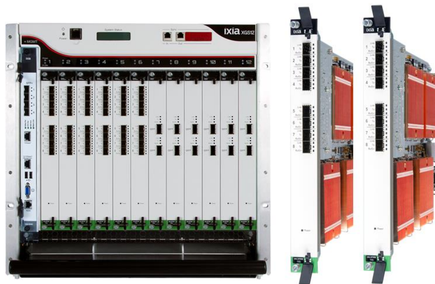
XGS12-HS chassis and PerfectStorm 10/1GE Load Modules

A single, integrated system equipped with 12 PerfectStorm blades allows control of application traffic to nearly a terabit, up to 720 million concurrent connections, and new TCP connection rates of up to 24 Million. The hardware-based acceleration supports massive encryption levels with up to 240Gbps of SSL traffic and 480Gbps of IPsec traffic per system. The system uses inline field programmable gate arrays (FPGAs) for enhanced accuracy pertaining to latency measurements with a resolution of 10ns.