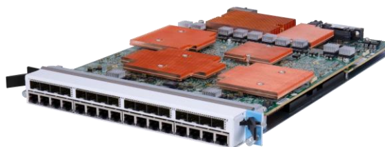
NOVUS10/5/2.5/1/100M16DP 16-port Dual-PHY 5-speed load module