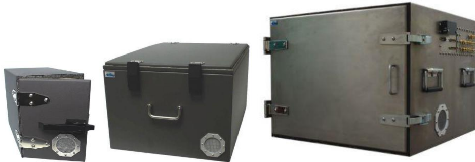
Ixia WaveChambers: Small, Medium, and Large

Designed to provide a simple and space-efficient solution for large-scale testing environments that involve multiple wireless APs, Ixia's WaveChamber provides the isolation, cooling, and filtered signal connectivity needed to achieve accurate and repeatable results. WaveChamber provides an RF-isolated environment small enough to support rack-mounting and desktop use, yet large enough to house most access points in a small, medium and large footprint.