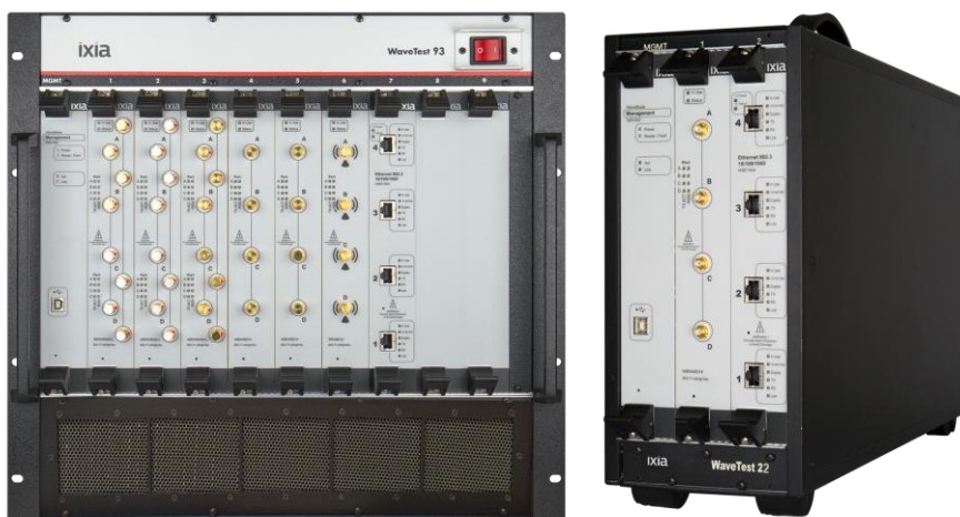
Ixia WT93 and WT22 Chassis