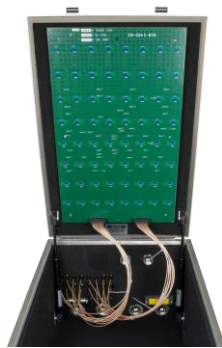
Ixia Antenna Array

The WaveWrap is a custom folding enclosure for optimal over-the-air RF testing of a device. It supports 2x2 using 2 SMA connectors with 4 enclosed antennas.